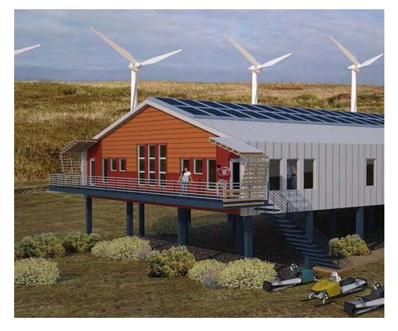
Figure 4. From the firm, George Watt Architecture of Bolder Colorado.

Nevertheless, the following figure no. 4 is Mr. Watt's rendering of the SIPs manufactured building once it is assembled in Mertarvik. On July 10, 2012 the SIP panels, lumber, gravel and equipment were delivered to the MEC site. With that shipment, all the supplies necessary to assemble and construct the evacuation center had been delivered.