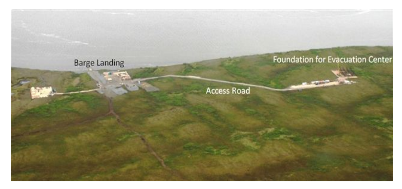
Figure 1. The beginning of a new village--Mertarvik Barge landing, Access road and evacuation center foundation (right).