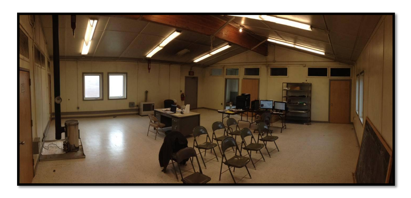
New Office/Administrative Offices Area for the Newtok NTC

The NTC has secured a location and with gracious cooperation of the Alaska National Guard, has secured the use of the Armory in Newtok. This space will allow the NTC to revive, quickly the stalled administrative and management functions for the Council.