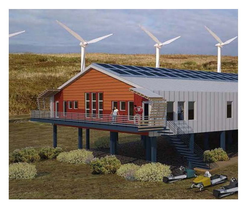
Figure 4. From the firm, George Watt Architecture of Bolder Colorado.

Nevertheless, the following figure no. 4 is Mr. Watt's rendering of the SIPs manufactured building once it is assembled in Mertarvik. On July 10, 2012 the SIP panels, lumber, gravel and equipment were delivered to the MEC site. With that shipment, all the supplies necessary to assemble and construct the evacuation center had been delivered.