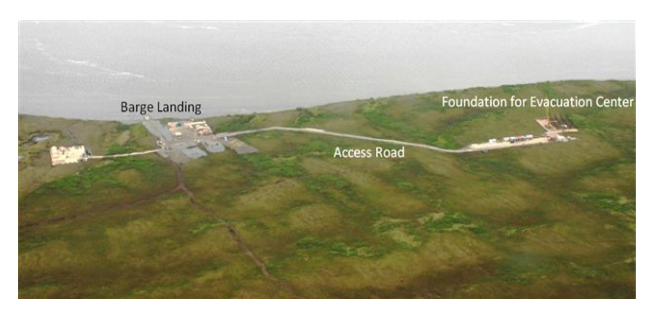
Figure 1. The beginning of a new village--Mertarvik Barge landing, Access road and evacuation center foundation (right).